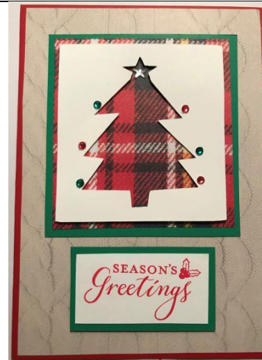
CJ 03 2 available