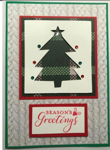
CJ-02 2 available