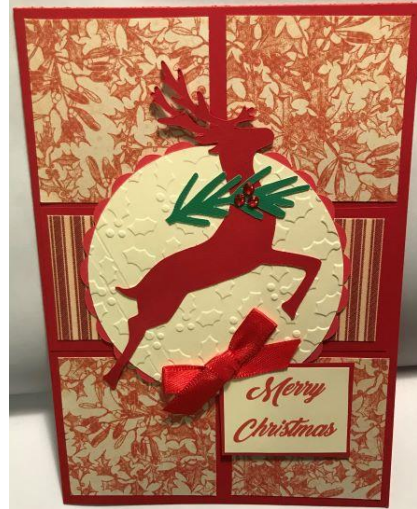
CJ 062 available